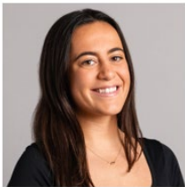
Taylor Ulrich Adaptive Sports Foundation

for student families experiencing food insecurity. They do amazing, on-the-ground work that has a direct impact on Somerville and neighboring communities.